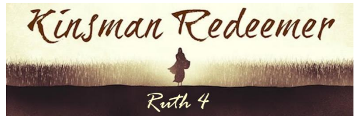
Promo Trailer for the Book of Ruth

Holy Bible, New International Version, NIV © 2011 by Biblica, Inc. Used with permission.