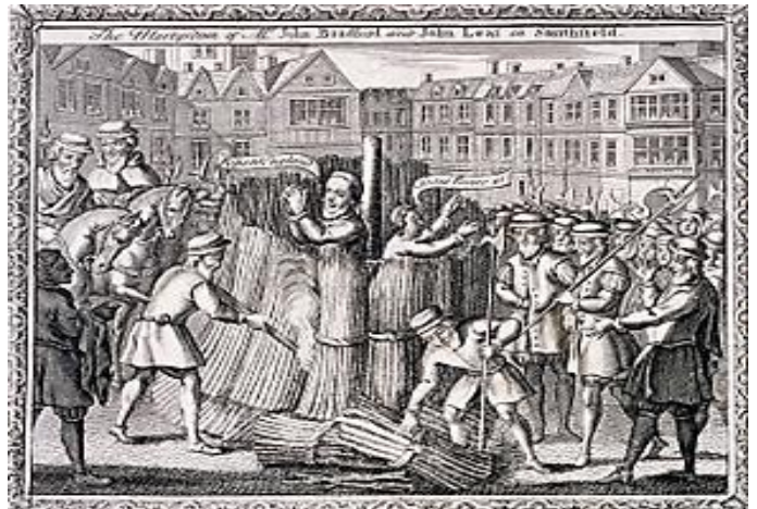
The martyrdom of John Bradford & John Leaf in Smithfield, London, ENG (January 1, 1555). Captions: from John Bradford: "Repent England"; from John Leaf: "Jesus receive us."

? What do you make of the choice God puts before us? Why do you think so many people choose not to choose life?